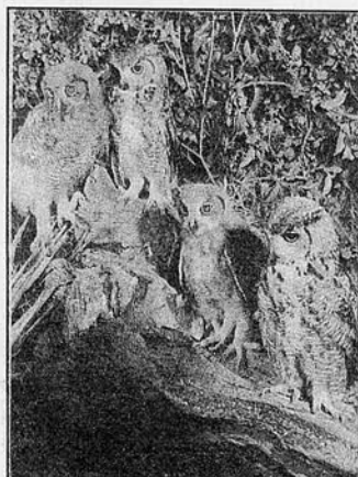
Ice Berg and Great Horned Owl Family